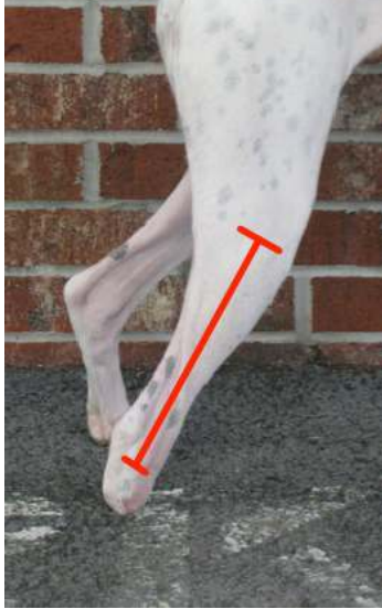
1. Fibular Head - Lateral Malleolus: _____