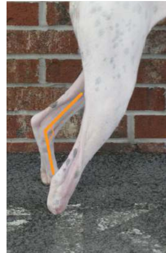
6. Standing angle of tarsus of "GOOD LIMB" (fibular head, lateral malleolus, 5 th met head) _____